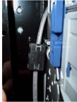
Figure 3 With Bill Validator installed